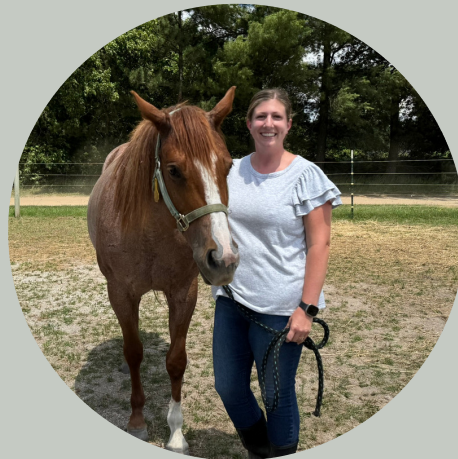
MORGAN PAEPLLOW ESMHL