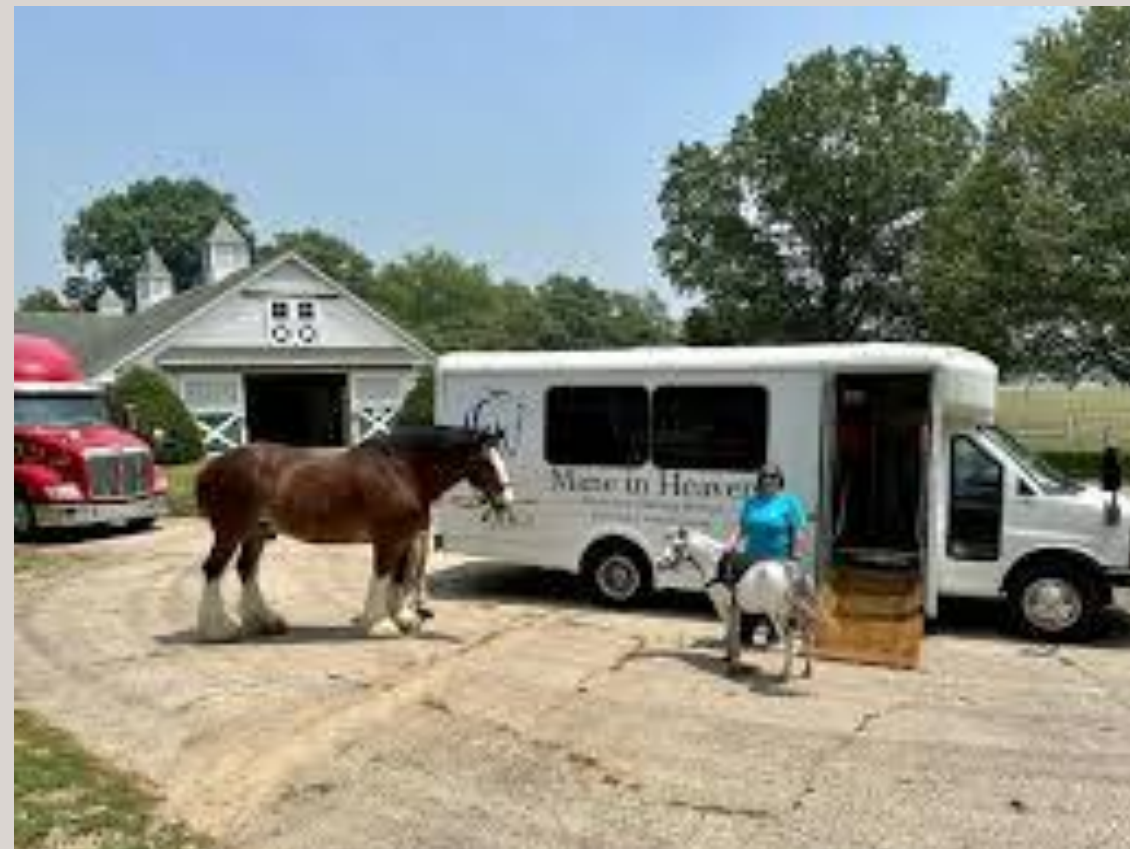
Mane in Heaven Miniature Therapy Horses