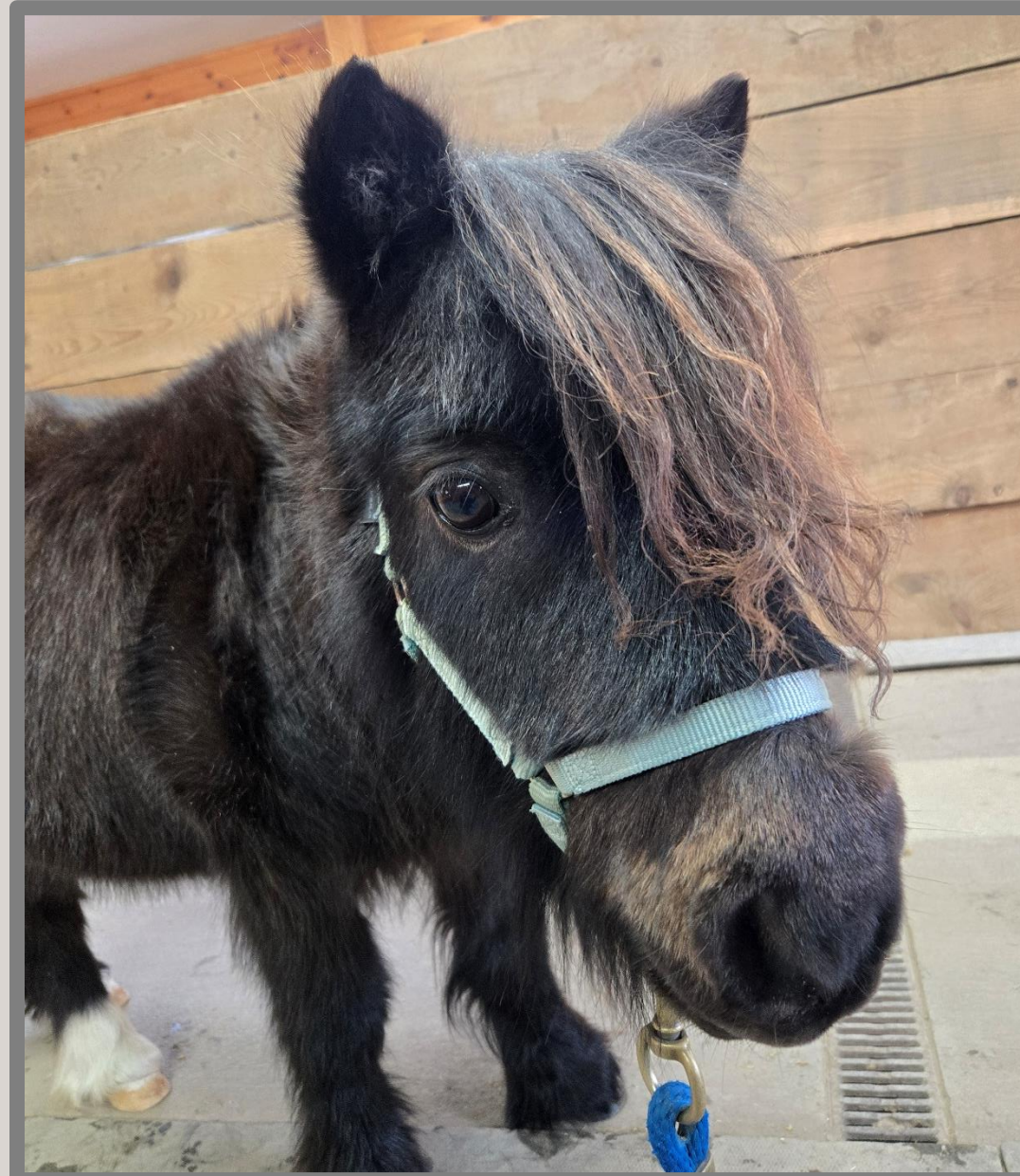
Apollo 20 Year old Mini