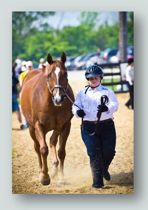
2024 Runner Up, Amigo