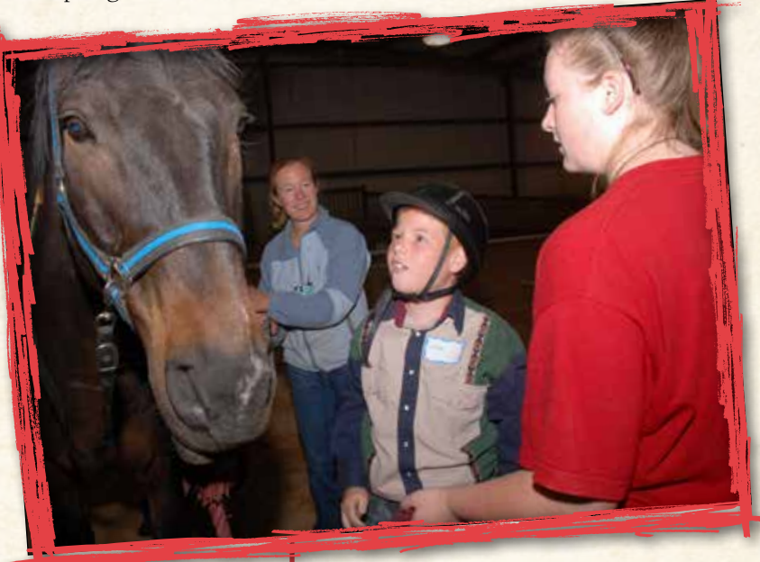
Colorado Therapeutic Riding Center, Inc., Longmont, CO

the fans it lost when staff had to recreate a new page due to the name change. It continues to be a nice "gathering place" for members and supporters and has been successful as a marketing tool in a limited-time conference registration promotion, for sponsor promotions and in marketing PATH Intl. webinars, as well as in supporting the holiday appeal and other giving campaigns.